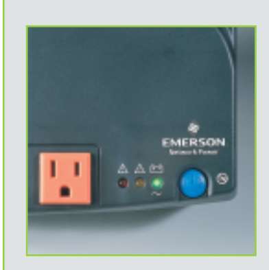
Status indicators let you know the condition of the UPS.